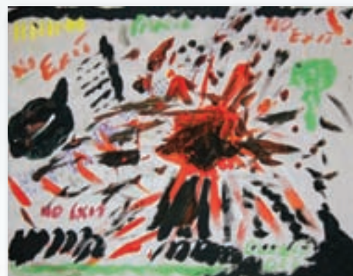
No Exit Tony Montgomery Royal Marines 1979-86 A day in the life of someone with Post Traumatic Stress Disorder