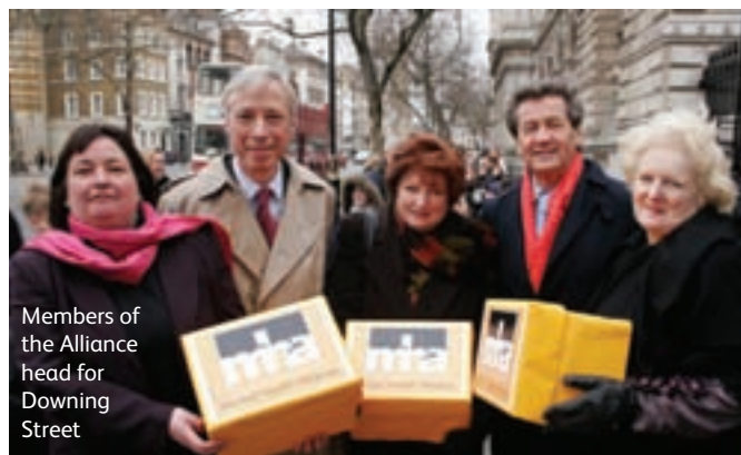
Members of the Alliance head for Downing Street

Therefore we are disappointed that access to independent mental health advocates is not currently available. This would act as a safeguard for individuals whose wellbeing