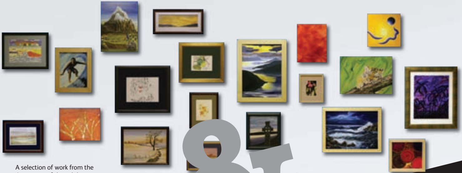
A selection of work from the Art section of the exhibition