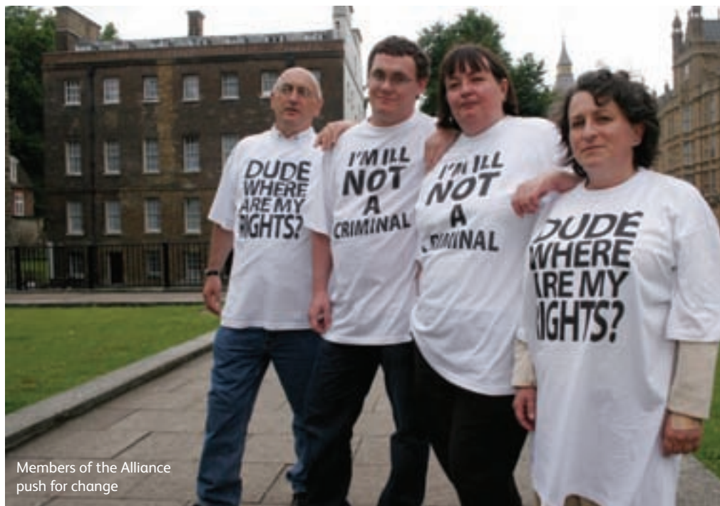
Members of the Alliance push for change

Together is particularly concerned that while the compulsory powers of the Mental Health Act have now come into force, there is now