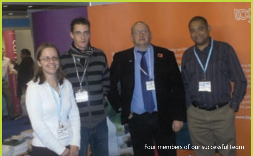
Four members of our successful team

The 2008 Mental Health Today Exhibition saw more than a thousand health sector professionals attend this valued one day conference in Manchester. Together hosted the Service User Leadership Zone, an information stand and two seminars focusing on workplace stress and the Mental Capacity Act. Delegates flocked to both Together seminars which were so well attended that for latecomers there was standing room only. Together's areas were manned by a cross section of staff and service users who energetically promoted our unique way of working and made some excellent contacts with commissioners and professionals who were keen to explore our work further.