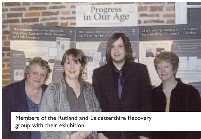
Members of the Rutland and Leicestershire Recovery group with their exhibition