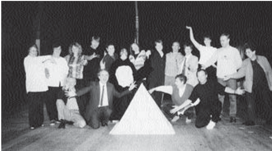
The cast of 'The Truth is Out There - Somewhere'