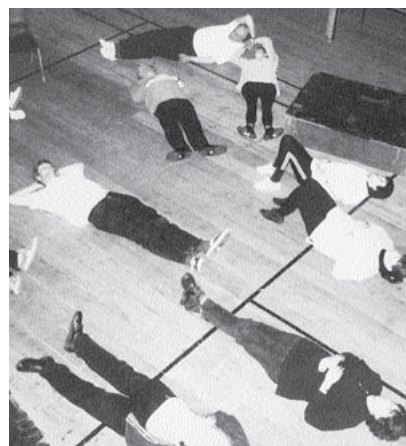
The cast collapses after a long dress rehearsal

Stepping Out Theatre is open to people who use and work in mental health services. Most of the participants appeared on stage for the first time in their lives last year after six months working on the production of "The Voyages of the Starship