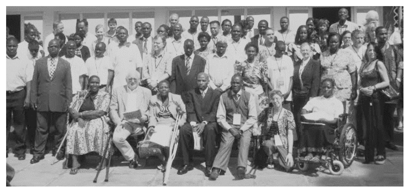
Some of the delegates in Kampala, March 2009. (For more pictures taken by Kampala delegates, you can view the web album at: http://picasaweb.google.co.uk/pierrelemunn/WorldNetworkOfUsersAndSurvivorsOfPsychiatryWNUSP?authkey=Gv1sRgCPCXIrKjvOfRvwE#)